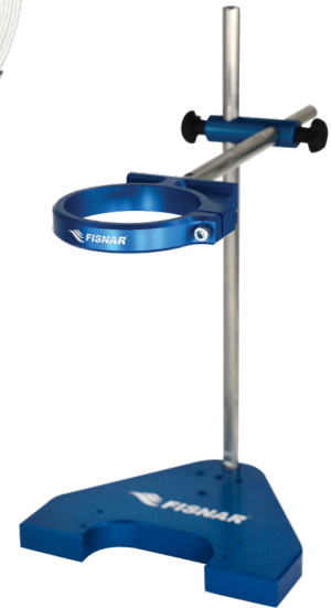
*560534U stand sold separately