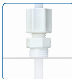
1/4" Tube Fitting

Can also be used with 710PT-U & 700PTPCW pinch tube valve & pen.