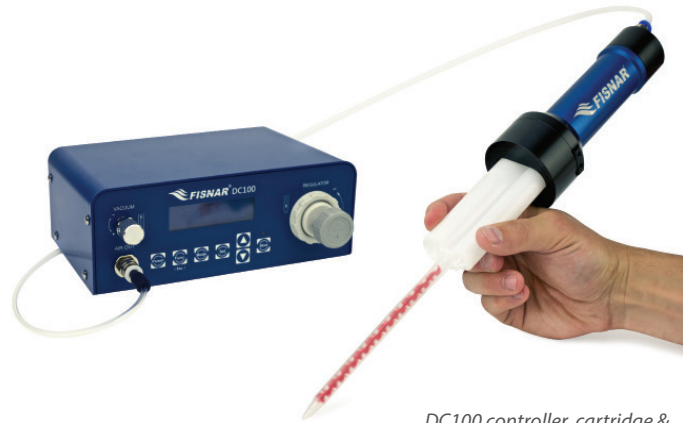
DC100 controller, cartridge & mix nozzle sold separately.

With its simple design and operation, accurate and repeatable fluid deposits are quickly and easily created when connect to a dispense controller.