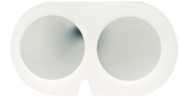
DTD50-RB for use with round back cartridges